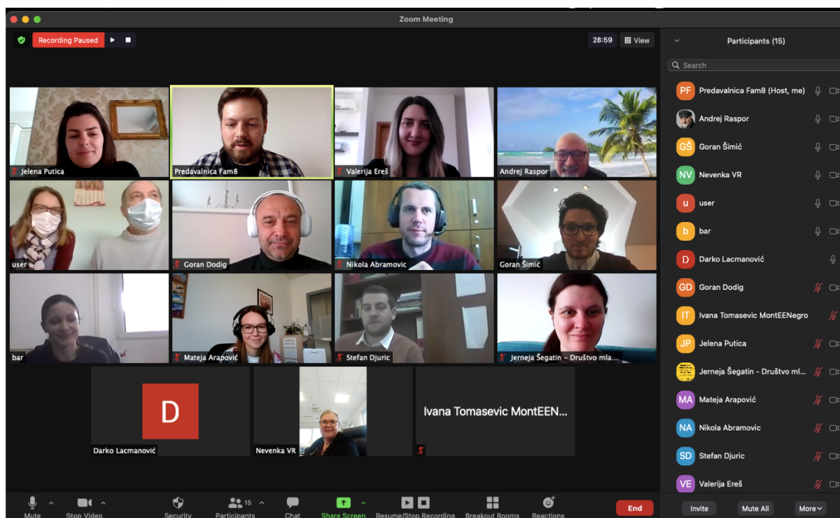
Proof 1. Participants at the Curriculum Development workshop

During the first day of the Curriculum Development workshop, participants were introduced to the topic of Course Syllabus and Curriculum. The discussion focused on the need of a curriculum and different types of curricula. Afterwards, the participants were introduced to the topic of Open Innovation and how to create a curriculum for Open Innovation.